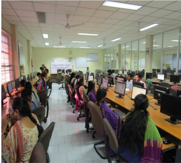
Students coding during the event