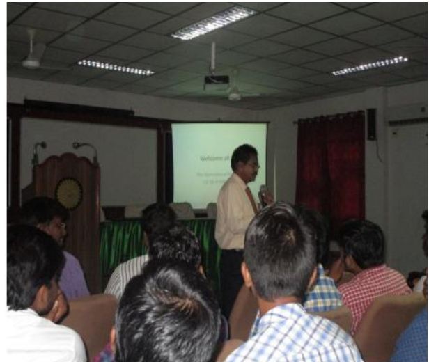
The Director of N.B.K.R.I.S.T speaking during the session