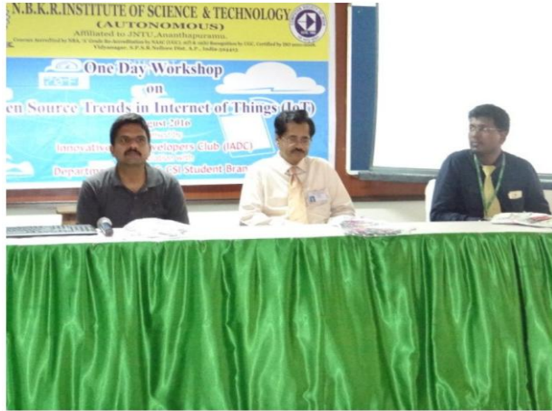
Dignitaries are on the Dias during the Inaugural Function of the IoT Workshop.