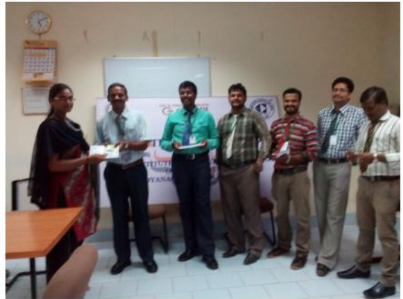
Participants receiving participation certificates