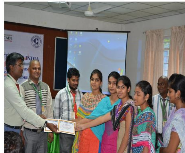
Winners receiving the merit certificates