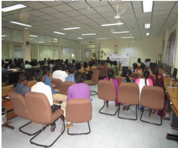
During the quiz