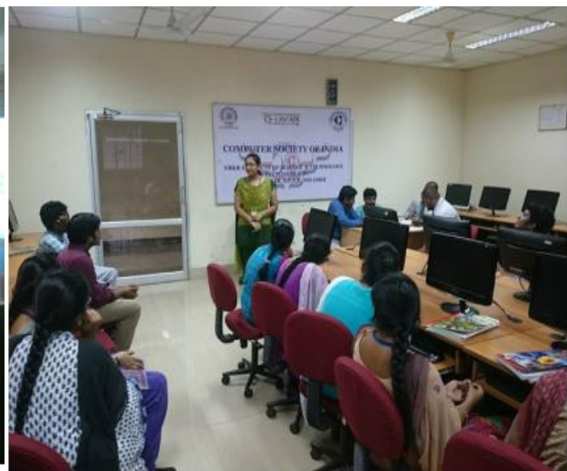
During the event