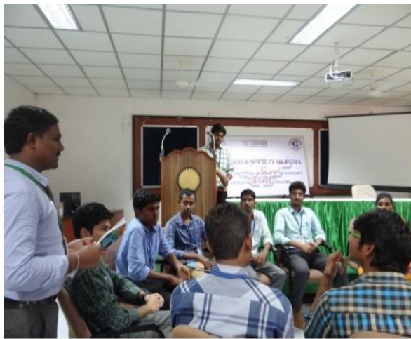
Coordinators Organizing the Group Discussion Event on "Digital India" to the participants.