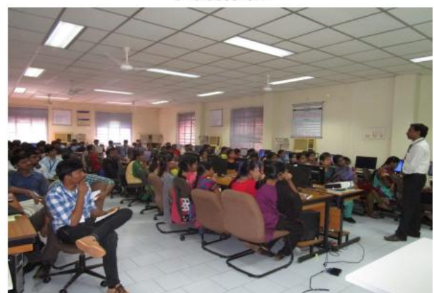
During the second day.