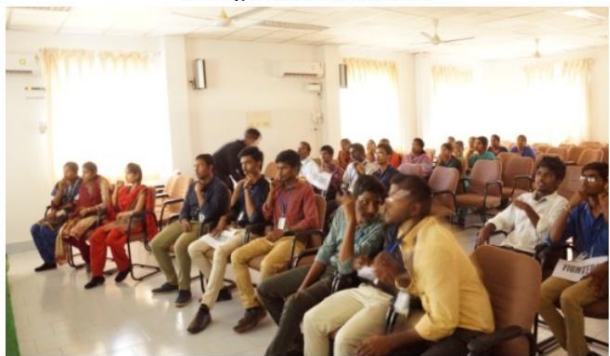
During the QUIZ Session..1