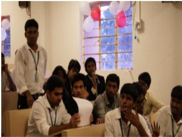
During the Debate Session..1