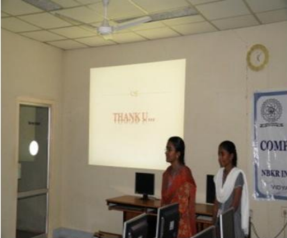
During the Paper Presentation Session