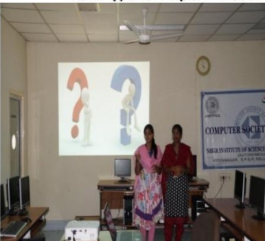
During the Paper Presentation Session