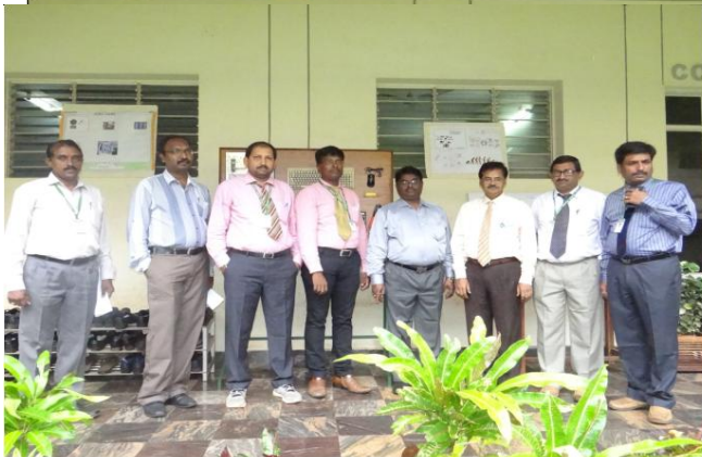
Dignitaries seeing the Chart & Model Expo