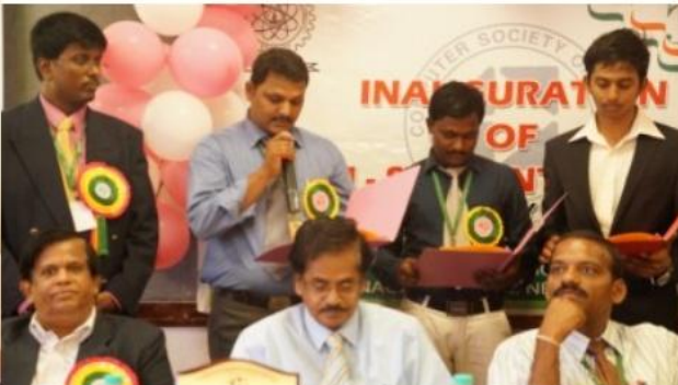
CSI-SB Office Bearers Taking Oath