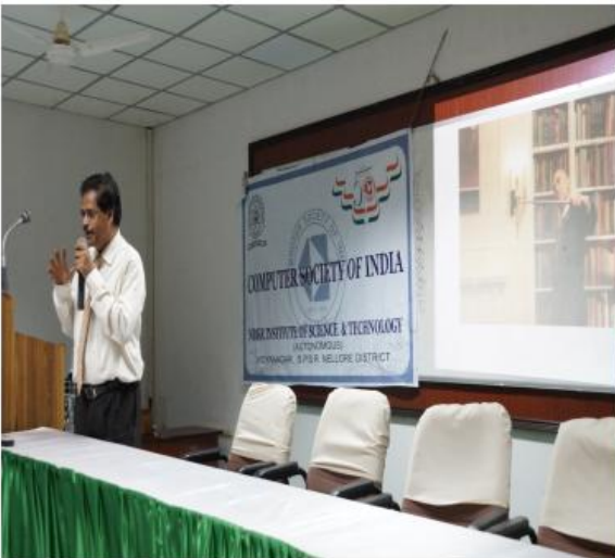
Director speech on the event