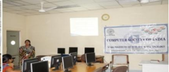
During the Paper Presentation Session