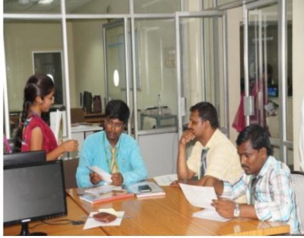
Judges working to decide the Winners