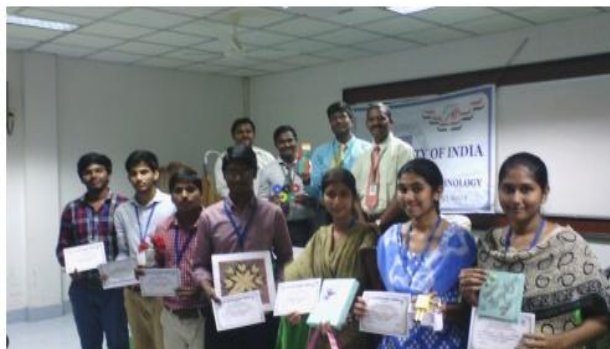
Participants with their innovative objects