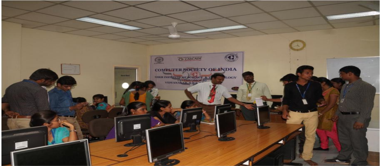
Knowledge Hunt Selections and the event in progress