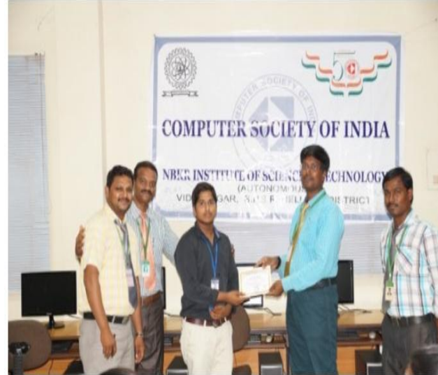
Participants Receiving participants certificates