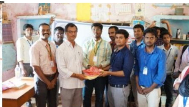
CSI Student Volunteers Distributing the Note Books