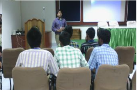
Judges entering the scores of participants, Active participation and feedback of students during the Quiz Session