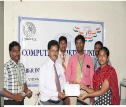
Certificates distribution to Winners