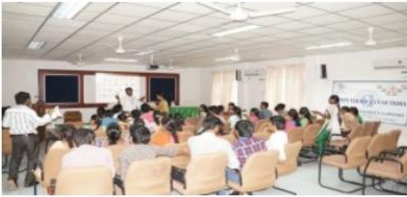
During the Quiz Session