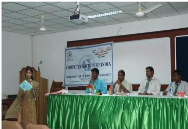
Participant explaining about their idea