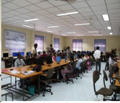
During the Debugging Session