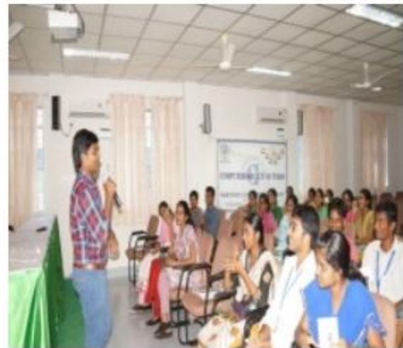
Participants giving their feedback