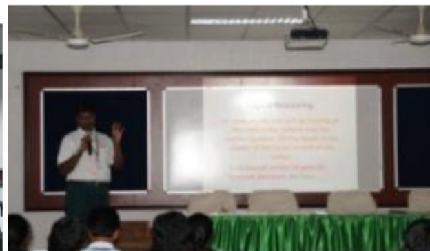
During the Quiz Session