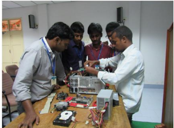
CSI Student Members Learning "Hardware Assembling and Infrastructure Management Training" from the trainers