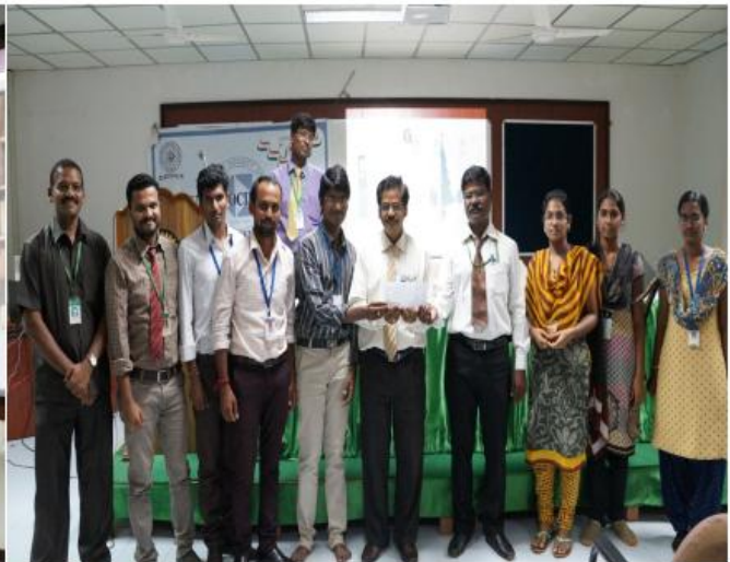
Distributing prizes to winners