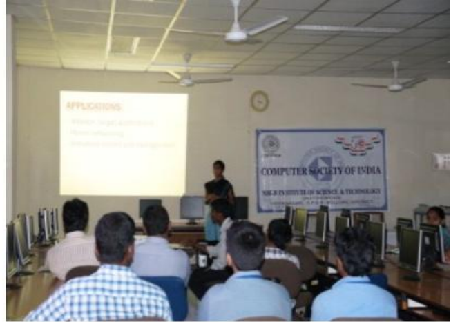
During the Paper Presentation Session