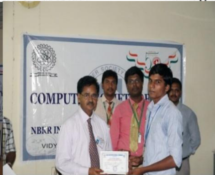
Certificate distribution to Participants