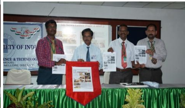
Distributing copies of CSI News Letter