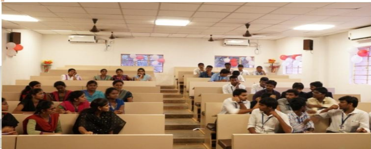
During the Debate Session..2