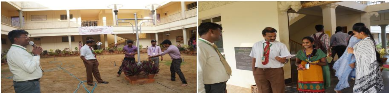
Social activity on 22.01.2016