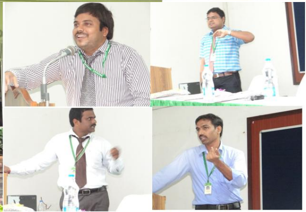
Faculties delivering training to the participants