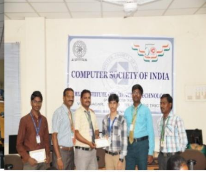
Winners Receiving Merit Certificates