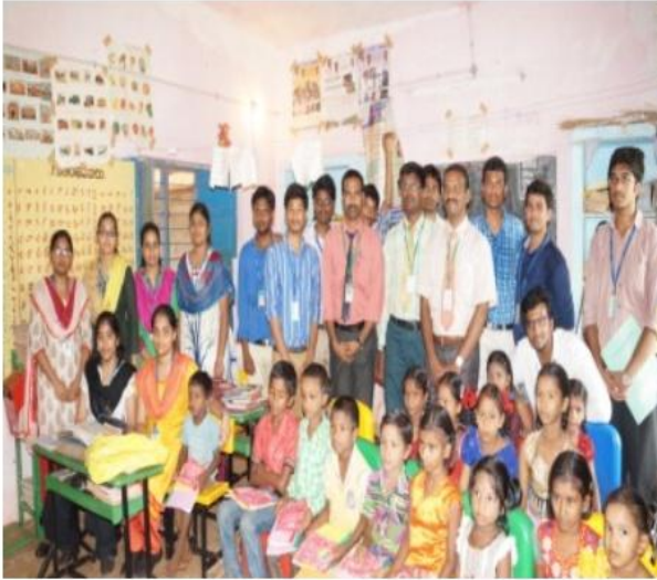
CSI Student Members with Chittedu School Kids