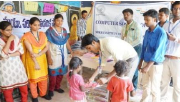
CSI Student Volunteers Distributing the Note Books