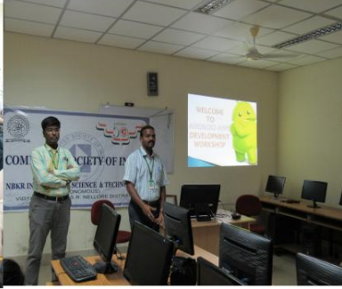
Workshop on Android Application Development held on 28-09-2015