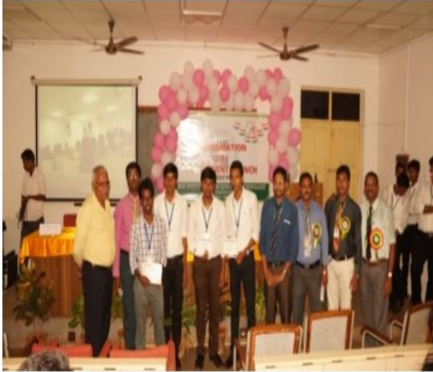
Participants receiving their certificates from the Guest of Honor