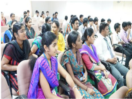
Participation of students in event