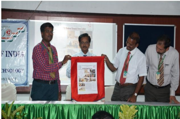
Launching of CSI news letter