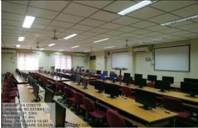
CSB-SOFTWARE DESIGN LABORATORY